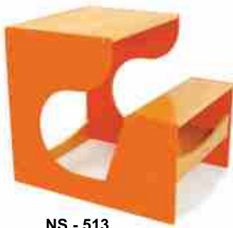
NS - 513