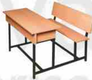
VE - 038