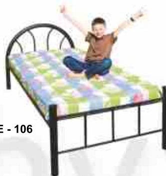
VE - 106