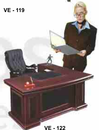
VE - 122