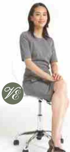
VE - 097