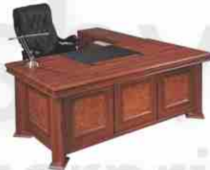
VE - 121