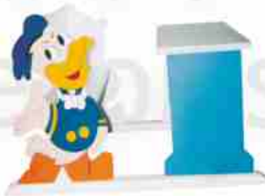
VE - 006