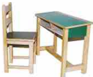
VE - 033