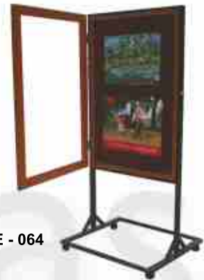
VE - 064