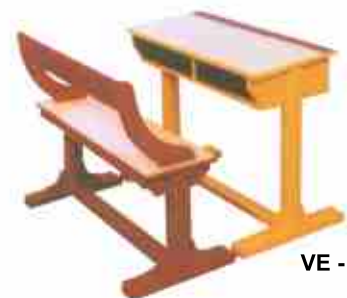
VE - 013