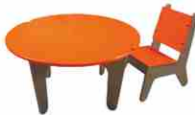
VE - 009