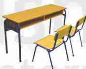
VE - 037