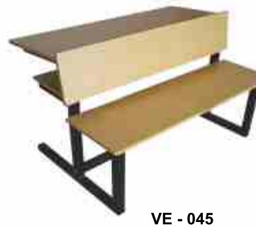
VE - 045