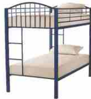
VE - 104