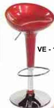
VE - 102