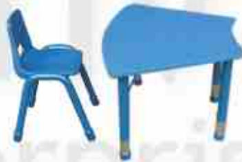
NS - 520