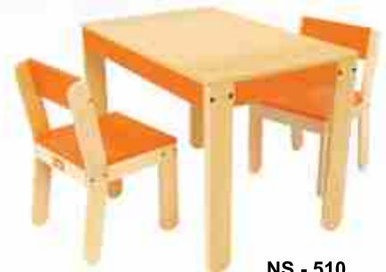
NS - 510