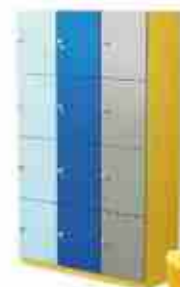
NS - 528