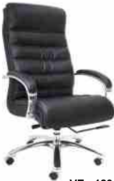
VE - 129