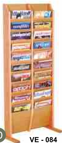
VE - 084