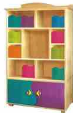
VE - 030