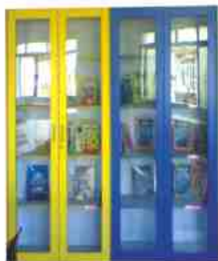
VE - 085