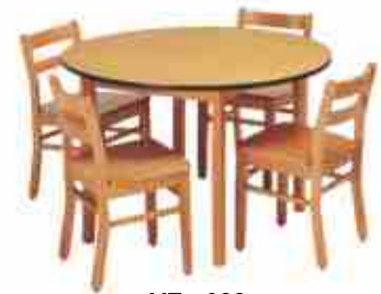
VE - 088

We manufacture and supply exclusively designed range of Cafeteria Tables as per the requirements of our clients. Our diverse assortment can be availed in various designs and color combinations. These are ideal for strenuous sitting, which make comforting.