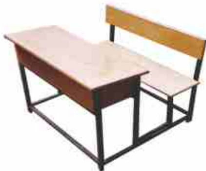
VE - 052