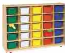
NS - 526