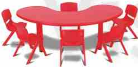
VE - 020