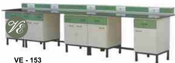
VE - 153