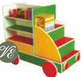
VE - 027