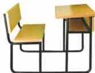
VE - 042