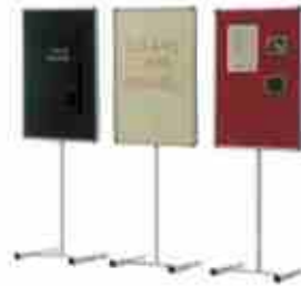
VE - 060