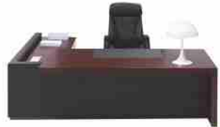
VE - 119