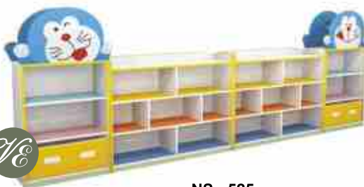
NS - 525