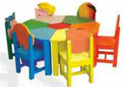
VE - 004