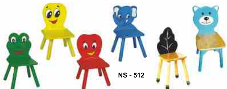
NS - 512