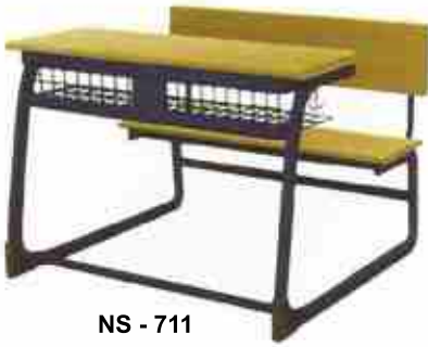
NS - 711