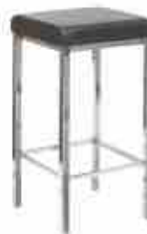
VE - 101