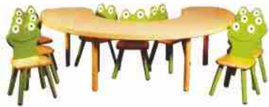
NS - 515