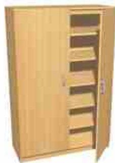
VE - 111