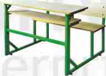
NS - 718