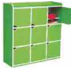
VE - 029