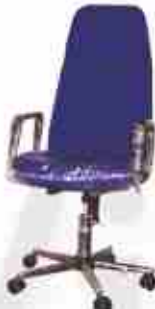
VE - 134