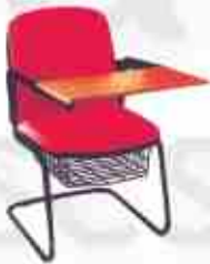
VE - 143