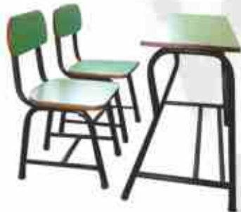
VE - 049