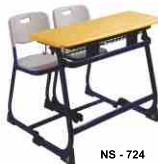
NS - 724