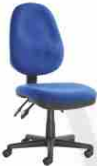
VE - 133