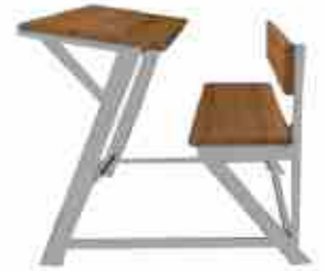
NS - 716