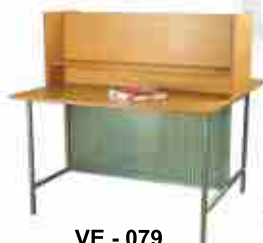
VE - 079