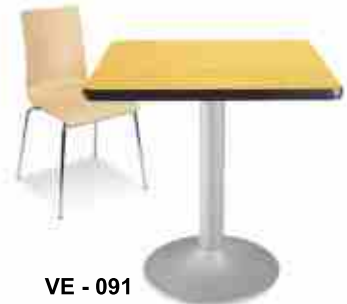
VE - 091