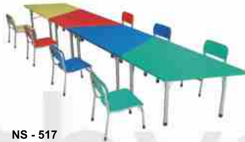
NS - 517