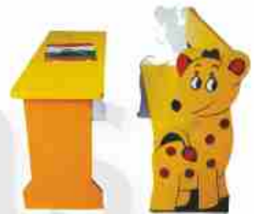
NS - 507