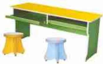
VE - 014