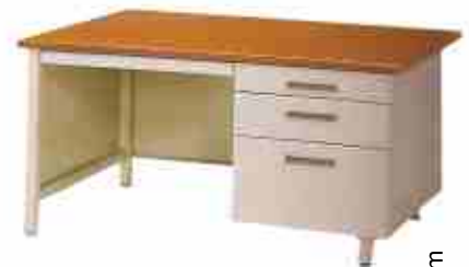
VE - 124