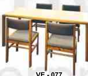
VE - 077