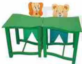
VE - 005