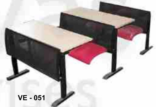
VE - 051