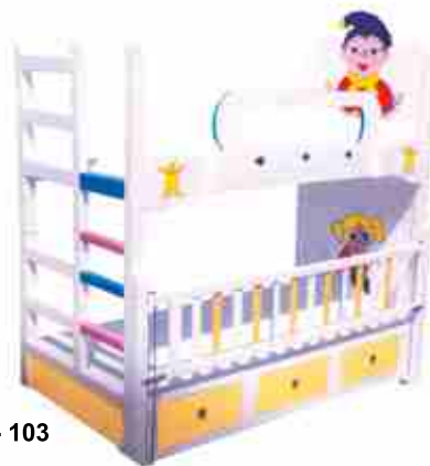
VE - 103