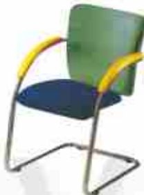
VE - 136