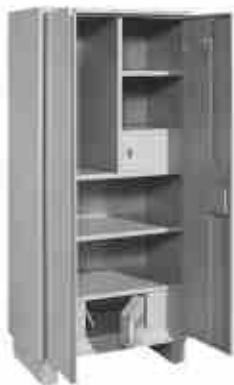
VE - 110