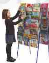
VE - 081