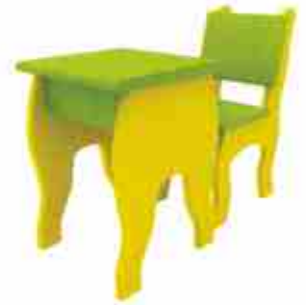
NS - 504