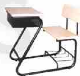
VE - 039