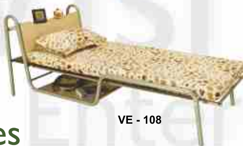
VE - 108