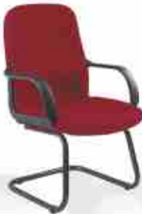
VE - 135