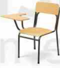
VE - 141