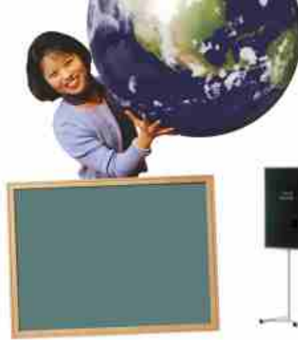
VE - 059