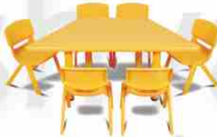
VE - 021