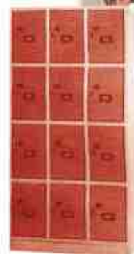
VE - 116