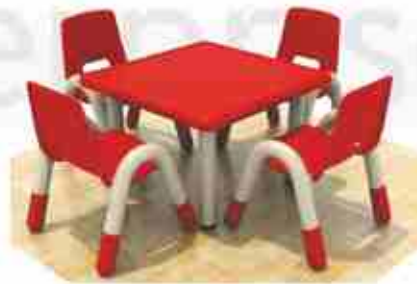
NS - 509