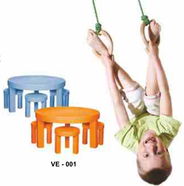
VE - 001

The method of teaching the child must be playful and inter-esting that help them to develop social and intellectual skills. Hence we also offer range of custom designed creative play school or kids furniture that helps in educational development of the child while playing. The unparalleled range of play school / kids furniture offered by us is available in various contrasting colors and kid life shapes & designs.