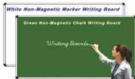
VE - 063