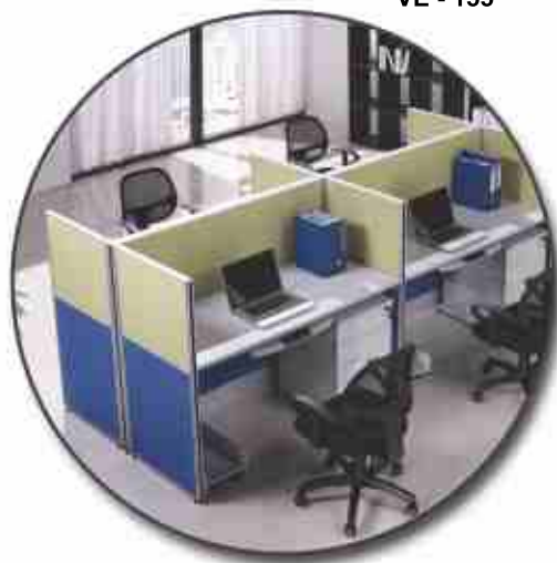
VE - 155