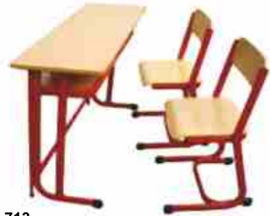
NS - 713