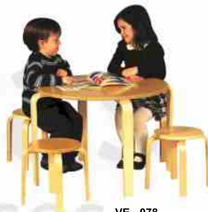
VE - 078