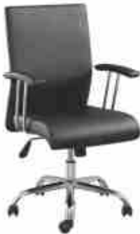
VE - 130