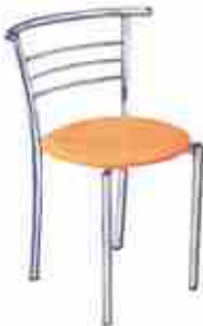
VE - 139