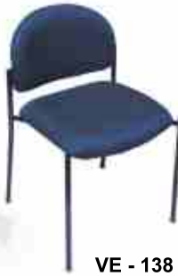
VE - 138