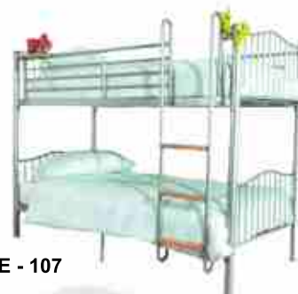
VE - 107