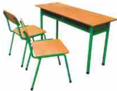
NS - 502