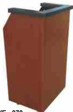
VE - 070