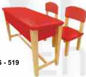
NS - 519