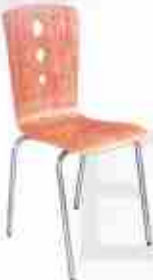
VE - 140