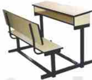
VE - 047