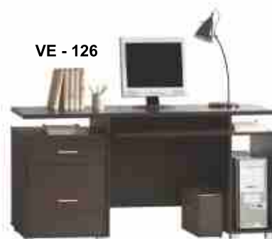
VE - 126