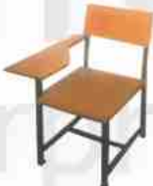
VE - 142