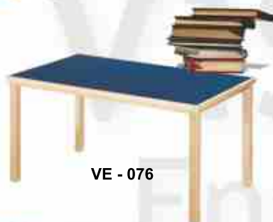
VE - 076