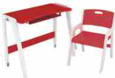
NS - 522