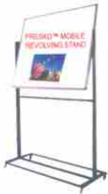
VE - 058