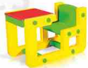
VE - 026