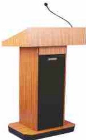
VE - 069