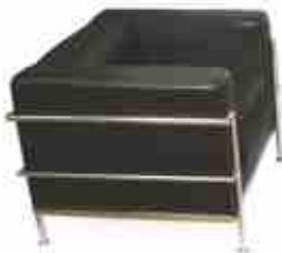
VE - 147