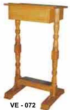
VE - 072