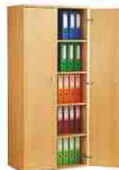
VE - 113