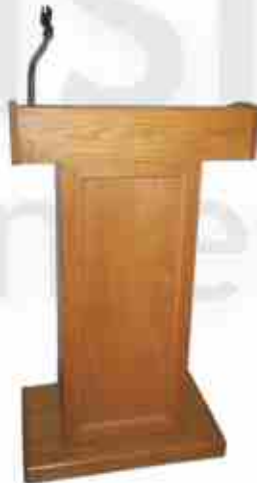
VE - 066