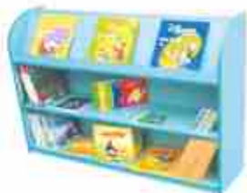
VE - 028