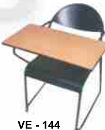
VE - 144