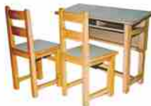
VE - 034