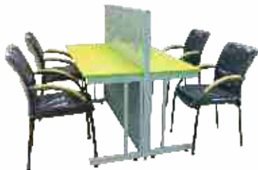
VE - 154