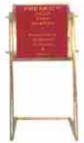
VE - 061