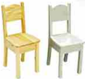
VE - 023