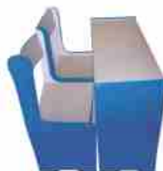
VE - 012