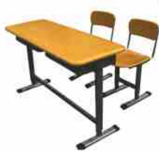
VE - 041