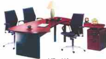
VE - 118