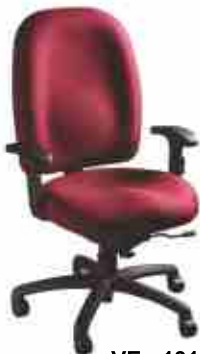
VE - 131