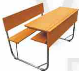
VE - 036