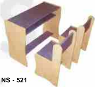
NS - 521