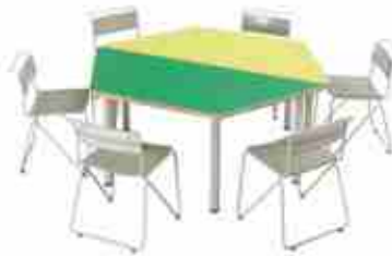
VE - 090