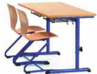
NS - 722