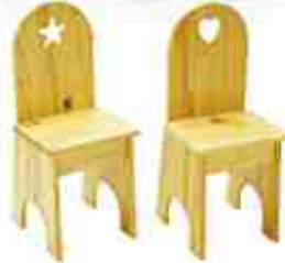
VE - 024