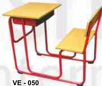
VE - 050