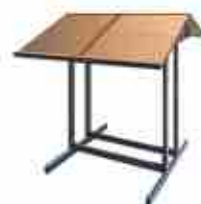
VE - 083