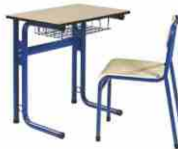
NS - 721