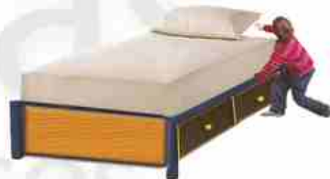
VE - 109