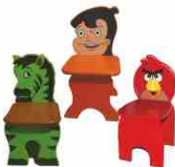
NS - 511