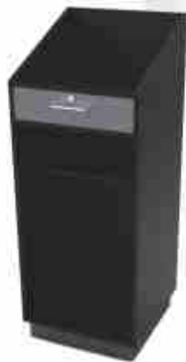
VE - 065