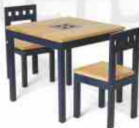
VE - 095