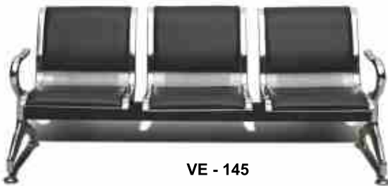
VE - 145