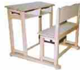
NS - 518