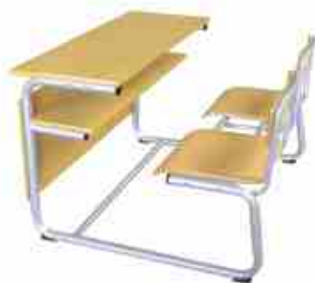
VE - 040