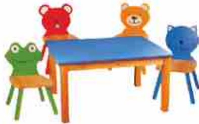
VE - 018