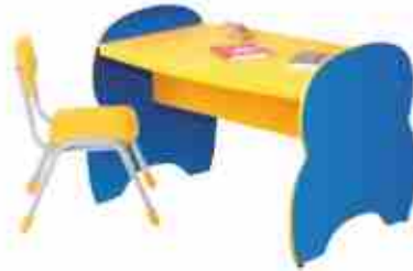
VE - 019