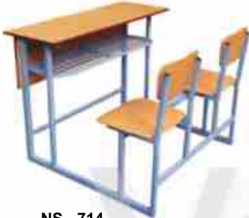
NS - 714