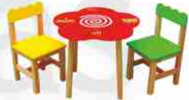
VE - 022