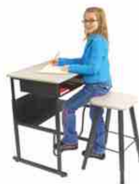
VE - 043