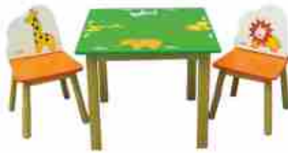
VE - 015