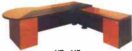
VE - 117

We specialize in developing durable as well as stylish workstations for various corporate offices and commercial establishments. We use premium standard wood, metal and other material for manufacturing them. Use of Superior quality polish provides them a charming look as well as enhance their longevity.