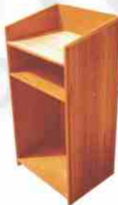
VE - 067