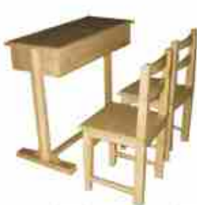
VE - 032