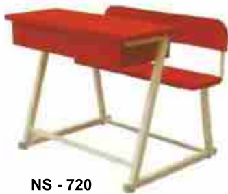
NS - 720