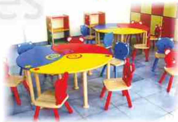
NS - 524