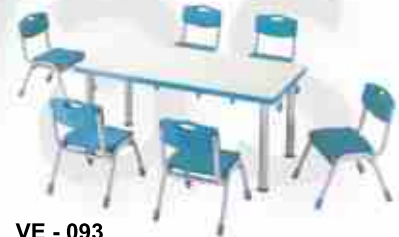
VE - 093