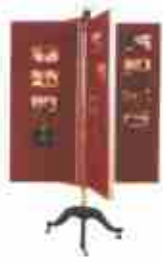
VE - 057