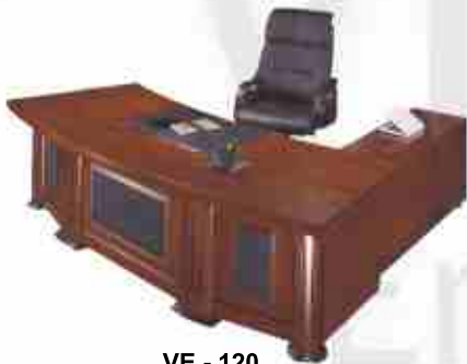
VE - 120