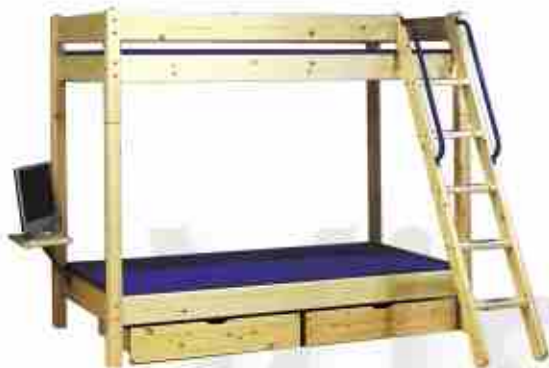
VE - 105