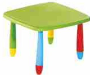
NS - 514