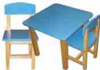
VE - 008