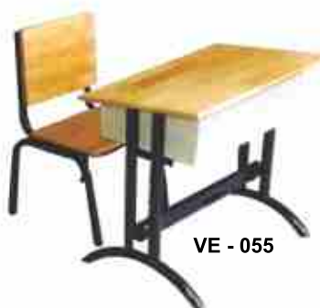
VE - 055