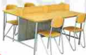
VE - 080