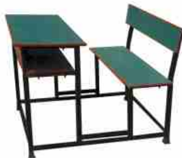
VE - 053