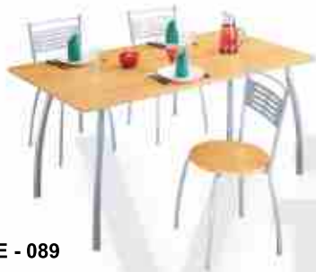
VE - 089