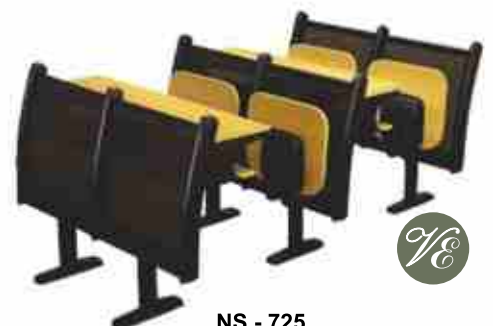
NS - 725