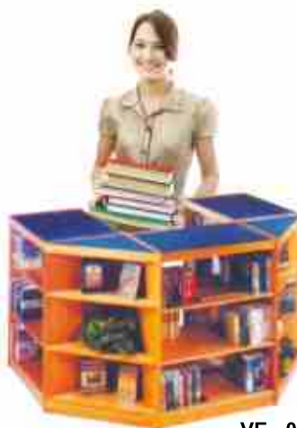
VE - 086