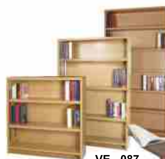
VE - 087