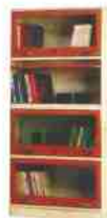
VE - 115