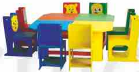
VE - 003