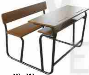
NS - 717