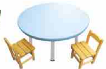
VE - 010