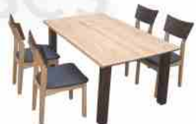
VE - 096