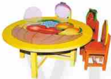
VE - 002