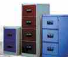
VE - 114