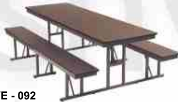
VE - 092