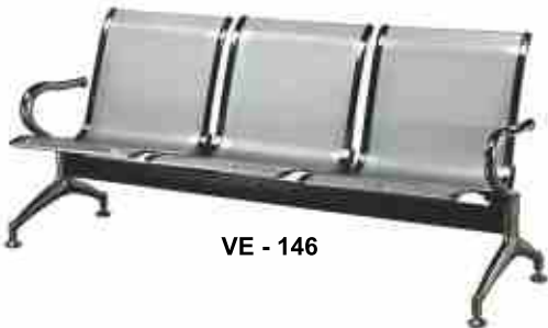
VE - 146