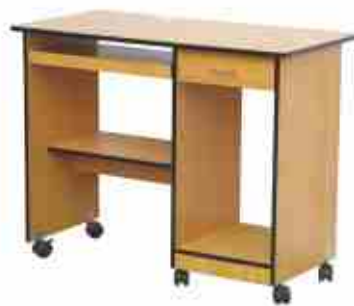
VE - 123