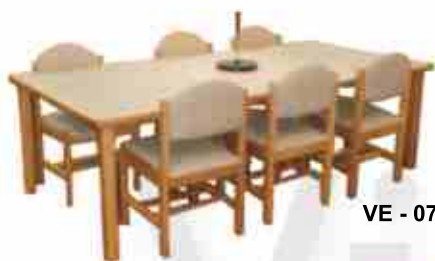
VE - 074