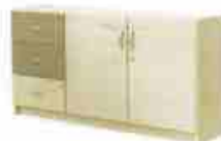
NS - 527