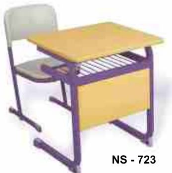
NS - 723