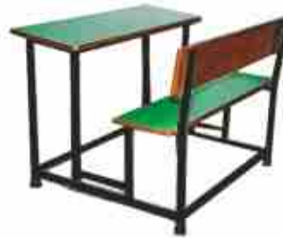
VE - 048