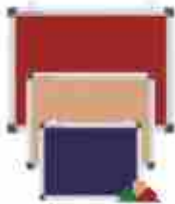
VE - 062