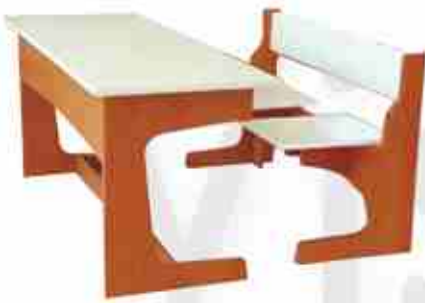
NS - 505