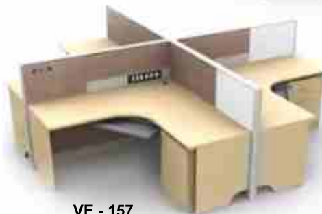
VE - 157