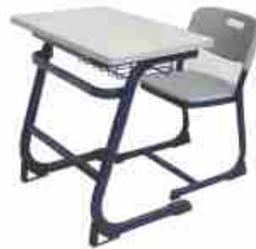
NS - 503