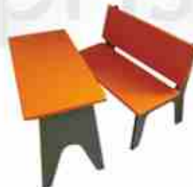
VE - 025