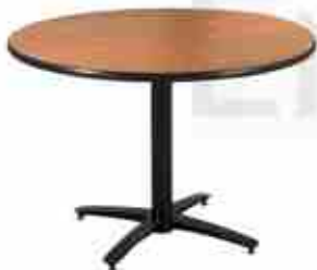
VE - 094