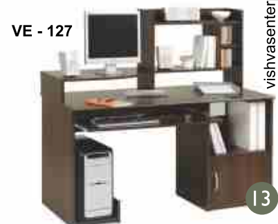
VE - 127