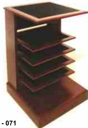
VE - 071