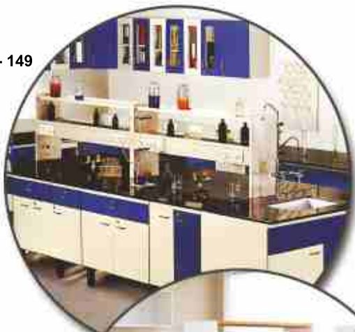
VE - 149