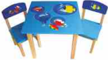
VE - 017