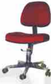
VE - 137