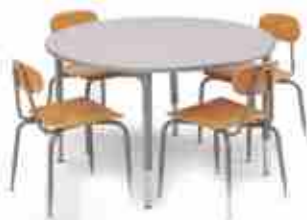
VE - 075