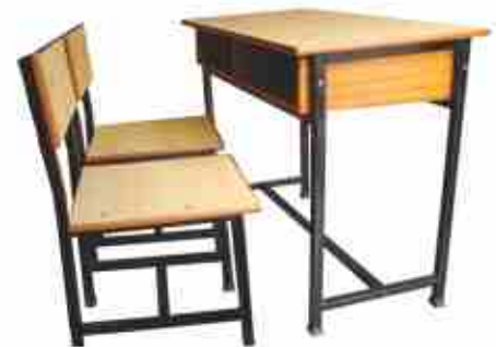
VE - 054