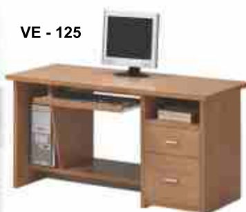
VE - 125