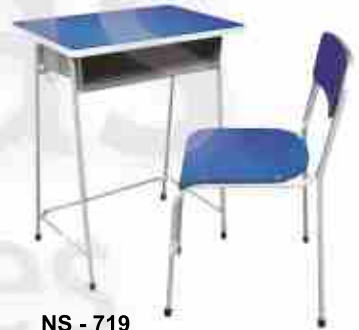
NS - 719