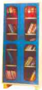
VE - 112