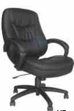
VE - 128