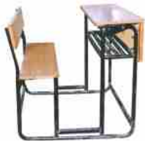
VE - 046