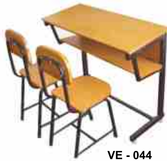
VE - 044