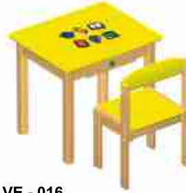
VE - 016