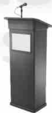
VE - 068