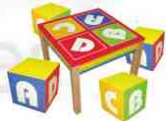
VE - 007