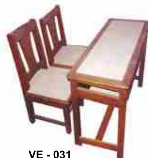
VE - 031

We offer a wide range of school furniture, which is extensively used in schools and different educational institutions. Our range of school furniture is manufactured from premium standard wood, metal and other raw material, which are absolutely proof to termite, corrosion etc and provide our range long life time