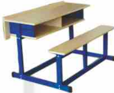
NS - 715