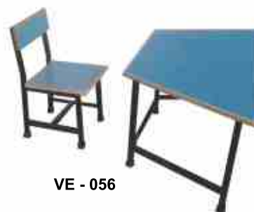
VE - 056