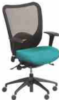
VE - 132