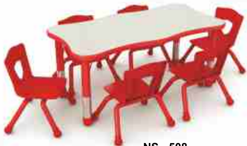
NS - 508