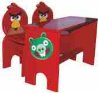
NS - 501