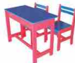
VE - 035