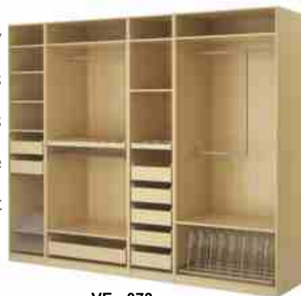
VE - 073

The library furniture we manufacture is designed from qualitative raw material procured from reliable source. These have multiple shelves for easy accommodation of numerous books. The Entire range has gained appreciation for their space saving features. these are available in different specification and can be customized as per the requirement suggested by the clients.