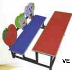
VE - 011