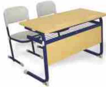
NS - 712