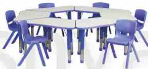
NS - 506