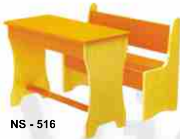
NS - 516