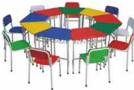
NS - 523